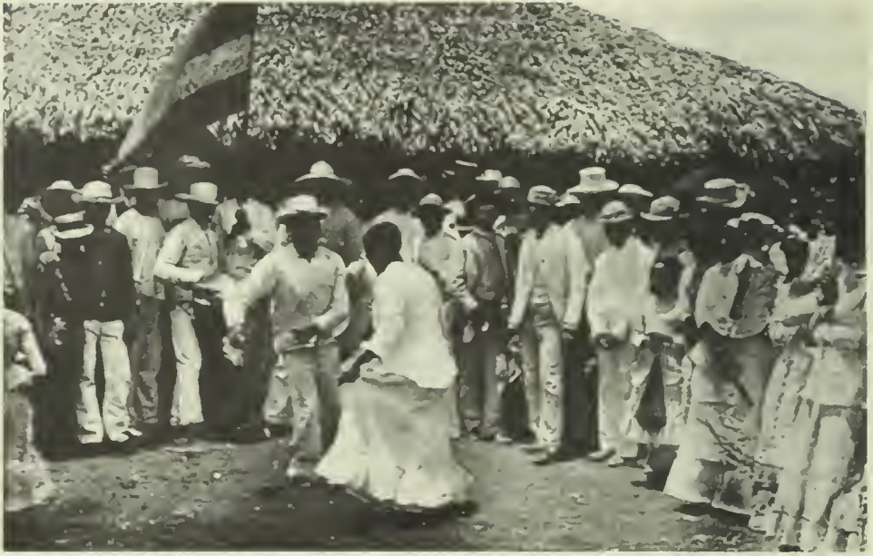
FIGURE 4.2 • Cubans of color dancing, Havana, c. 1898. The tri-band flag does not have a clear symbolic referent but the design allows for the possibility that it is a Spanish flag. The caption described this “typical Sunday morning scene in one of the side streets of Havana” and a dance referred to as “up and down and all chassée.” In Greater America: Heroes, Battles, Camps, Dewey Islands, Cuba, Porto Rico (New York: F. T. Neely, c. 1898).

about the boisterous festivities that African-descended cientfuegueros held that kept their neighbors awake. A stinging article asserted that “he who invented the delightful instrument that ought to be the drum of the negros de nación [African-born blacks] should be in the depths of hell.” 58